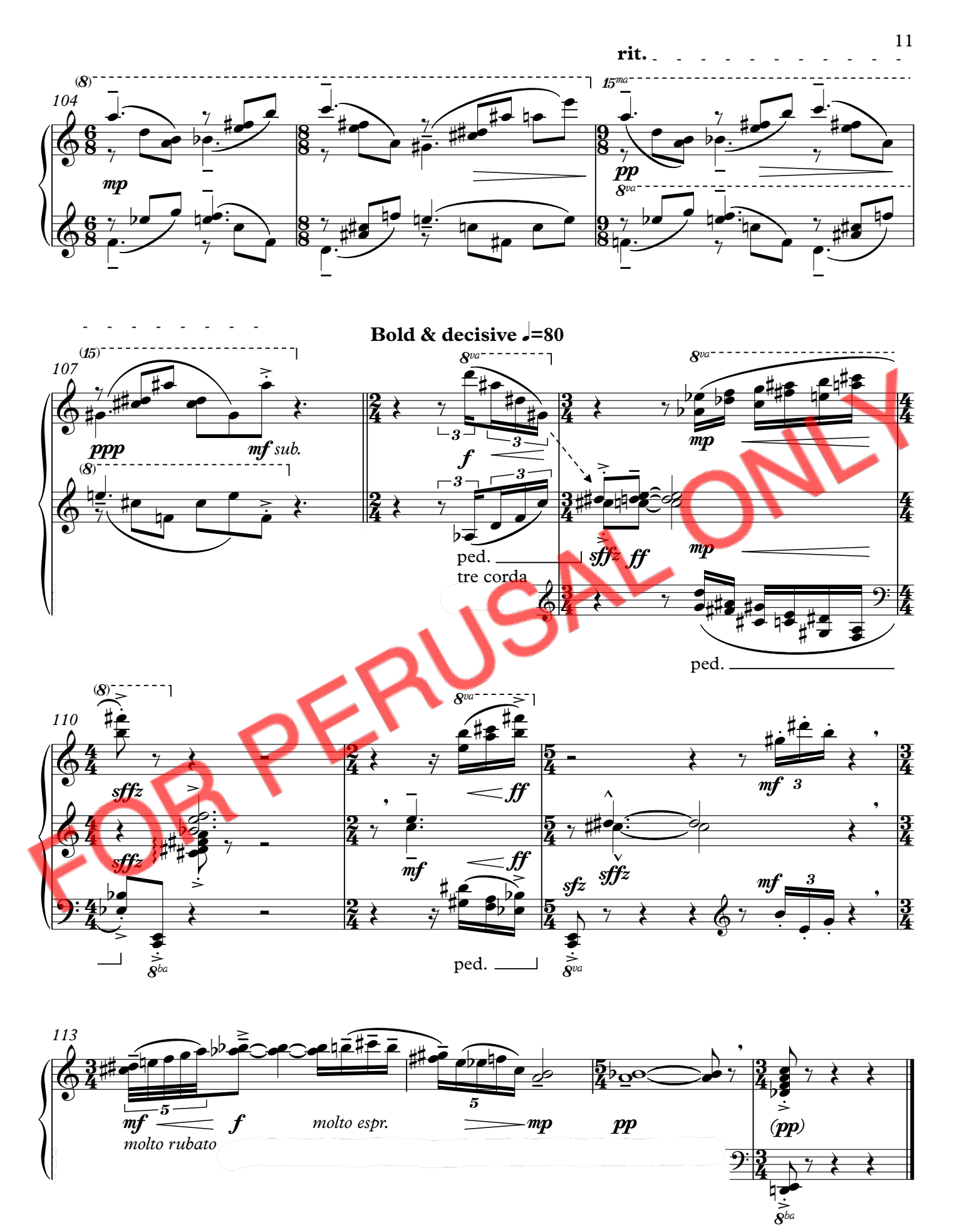
first version: May 2018 / second version: July 2020, Chicago